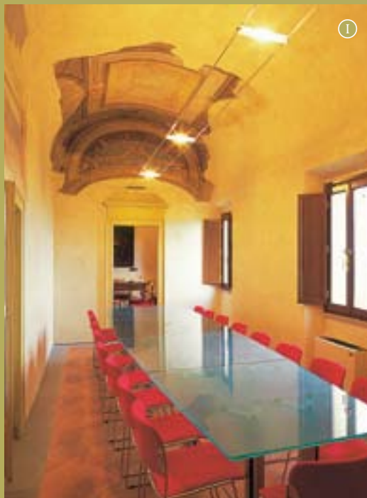
① The Council Room