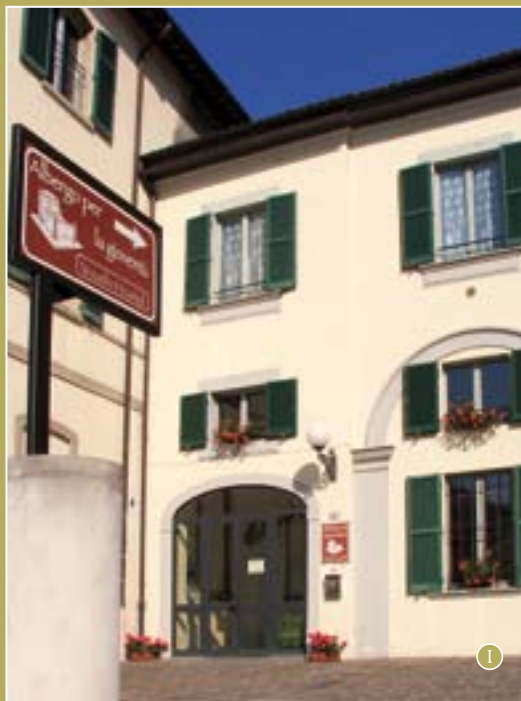
① The "Youth Hotel" in Santa Sofia