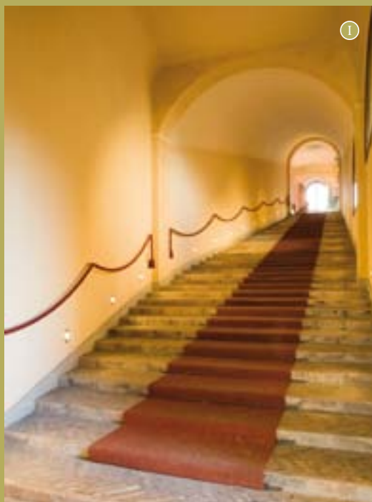
Ⓘ The stairwell of the Fortress