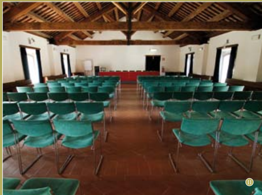
② The main classroom

All rooms are equipped with private bathroom, telephone, TV, data line connection system Wi-Fi and LAN.