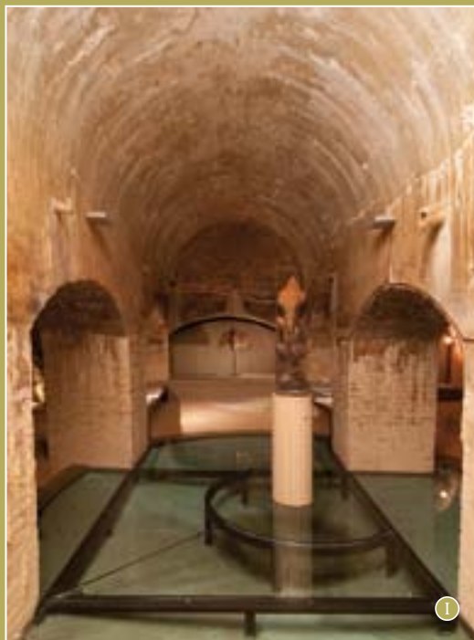
① The water tank