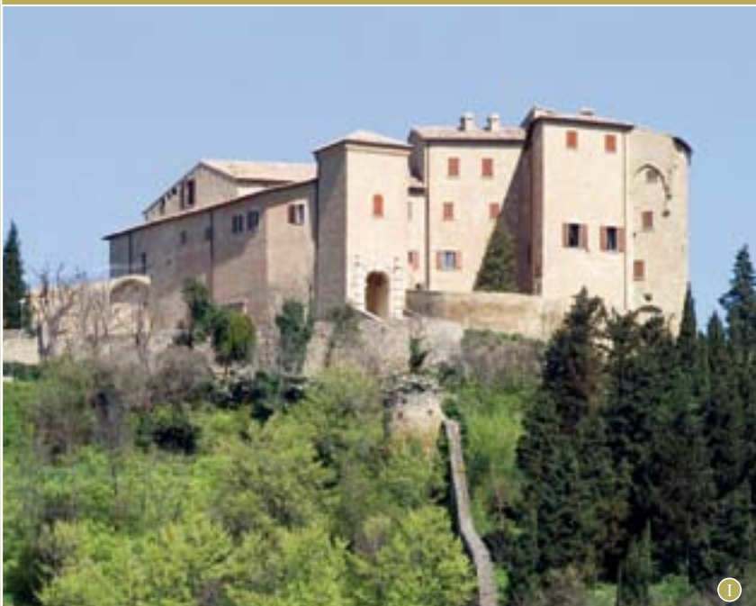
In front cover: the main entrance of the Fortress